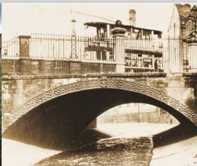
Above: Deritend bridge over the River Rea c1920s Left: The River Rea today