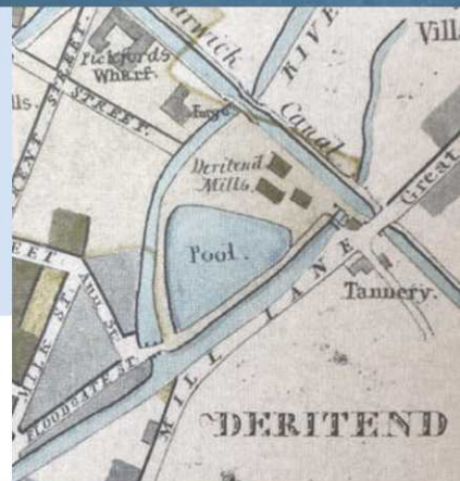
Right: Detail of 1820 map showing the millpond Below: St Basil's

Heath Mill Lane gets its name from a water mill that was originally located nearby. The mill was in use from at least the 16th century until the 1840s.