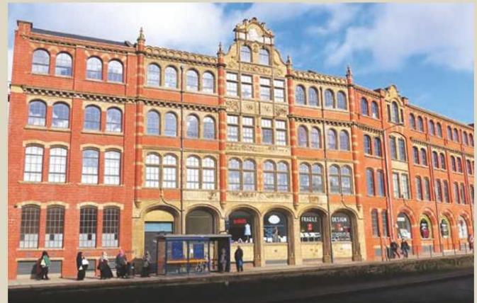
The Custard Factory

Today the history of Digbeth has come full circle with the delivery of two major transport infrastructure projects. The extension of the West Midlands Metro along Digbeth and High Street Deritend will be operational by 2027. The HS2 high speed railway line into Curzon Street Station is expected to be completed after 2030.