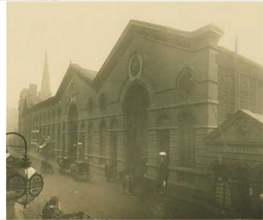
Right: Smithfield Wholesale Market, c1887

Following the manor house's demolition the area became the Smithfield Wholesale Market. In 2018 the market relocated to Witton and the Smithfield site is currently the subject of ambitious regeneration proposals.