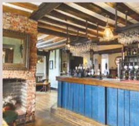
Above: The Old Crown Inn