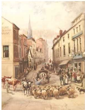
Looking up Digbeth to St Martin's Church by George Warren Blackham