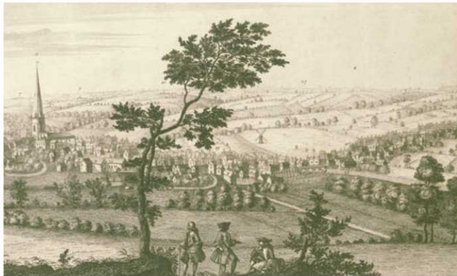
Buck Brothers' 1731 southwest prospect of Birmingham showing St Martin's Church and Digbeth

By the 16th century Birmingham had earned a reputation for its expertise in leather-tanning and metal-working. The Digbeth area was a centre for both of these trades thanks to a ready supply of water from the River Rea and several natural springs.