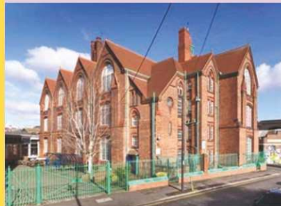
Left: Floodgate Street School

Floodgate Street gets its name from the floodgates which were used to control the water levels of the River Rea prior to it being culverted in the 1890s.