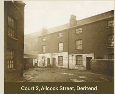
Court 2, Allcock Street, Deritend

For much of its history Digbeth was a residential as well a working neighbourhood. During the 1830s and 40s the area was settled by a substantial Irish community, many of whom fled the famines in their native country. However, most working class families lived in crowded, unsanitary courts of back-to-back houses.