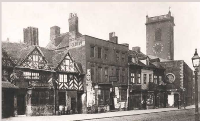
Below: 19th century photograph of the south side of Deritend High Street. The Golden Lion inn is visible on the left and St John's Chapel on the right