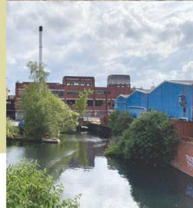
Right: Junction Works (top) and Typhoo Basin