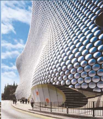
Above: Selfridges Left: St Martin in the Bull Ring

Established around 1166, the Bull Ring was the site of the medieval town's weekly market.