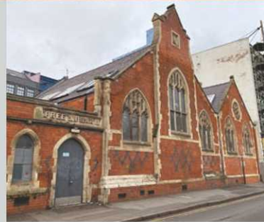
Above: Deritend Library building Right: Green Man sculpture by Tawny Gray