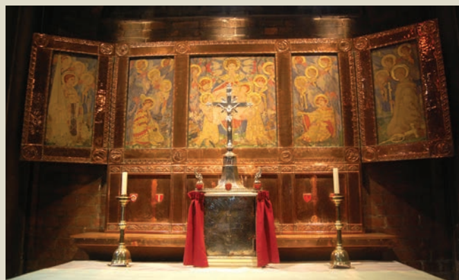
St Alban's reredos

Please note this map is an approximate guide to the relative sites listed within this publication and is not drawn to scale.