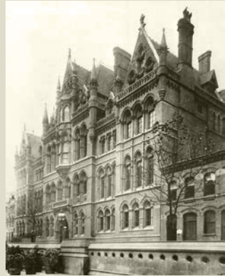
Mason College, 1880s