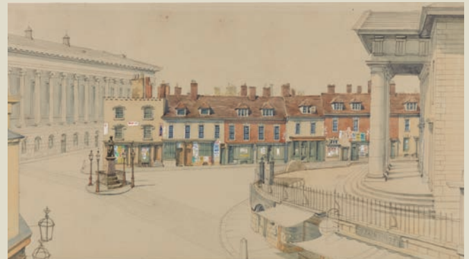
Ann Street