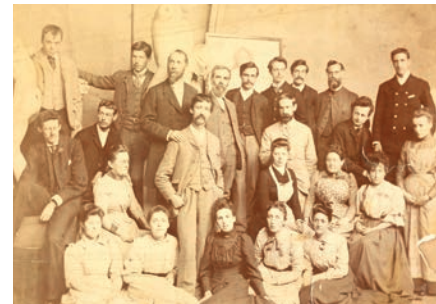
The Life Class , Birmingham School of Art, 1888