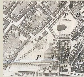
Detail of 1778 map showing Colmore Row and Ann Street