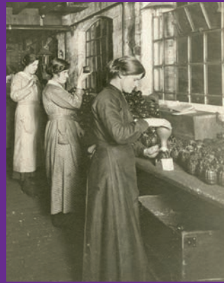
Female munitions workers

The stories and achievements of women from working class backgrounds and different ethnicities tend to be much less well known – although some of these hidden histories are now gradually being revealed.