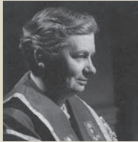
Dame Hilda Lloyd

Birmingham-born Dame Hilda Lloyd (1891 - 1982) was a pioneering obstetrician and midwifery specialist whose innovative ideas helped save the lives of numerous women and children in the city.