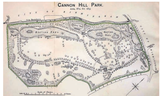
Map of Cannon Hill Park in 1892