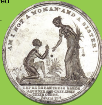
Women's anti-slavery medallion

Birmingham women also played a significant role in the campaign for female suffrage. The influential (and peaceful) Birmingham Women's Suffrage Society was formed in 1868. After 1903, some women joined the more militant Women's Social and Political Union – the suffragettes – who were prepared to commit unlawful acts to attract publicity for their cause.