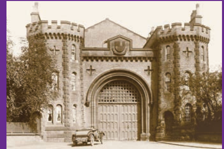
A number of Birmingham suffragettes were sent to Winson Green prison

Founded in 1918, Birmingham Civic Society was established to help preserve and celebrate the city's heritage, improve the urban environment and promote active citizenship.