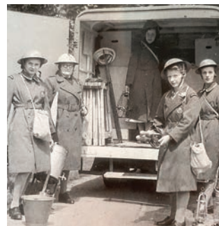
Female Civil Defence team, 1940

Women were key to the Birmingham war effort between 1939 and 1945. Thousands of women worked in the city's armaments and other factories. Many others served in the armed forces, or performed vital duties as nurses, ambulance drivers, ARP wardens and other roles.