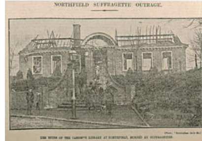
Newspaper cutting covering the arson attack on the Library in 1914