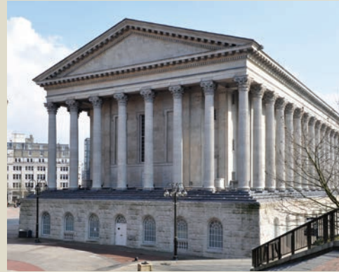
Birmingham Town Hall from Chamberlain Square